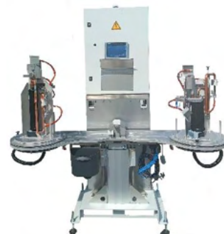
Brazing works flexibility with one or two operators per station, as well as one to four brazing jigs per station.